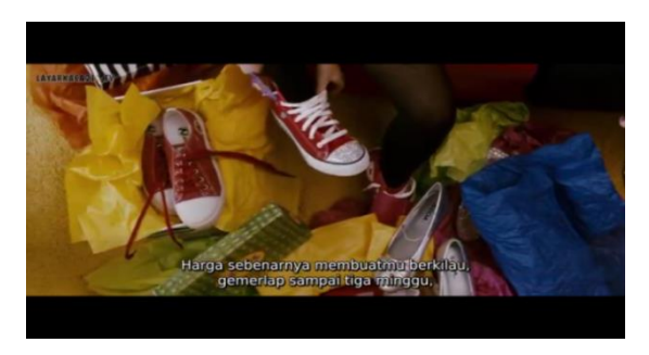
Figure 1.3 screenplay (00.45)