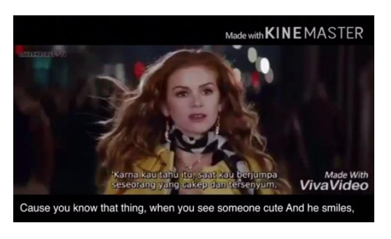
Figure 1.6. screenplay (01.58)

Lexical hedges features shows to express uncertainty and lack of confidence in the conversation, to differentiate one topic into another topic and as a filler in the conversation, to give the speakers sequence time to think what they will say next, to greet the addressee, to keep the conversation still on the track.