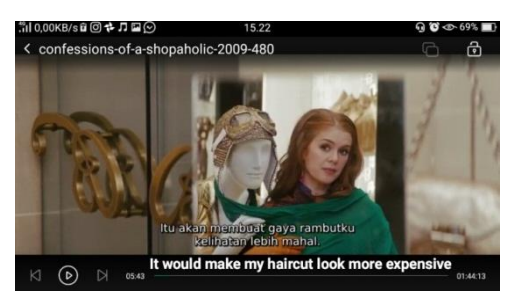
Figure 1.9 screenplay (03.42)

The other features of woman's language is hypercorrect grammar. Hypercorrect grammars uses to avoid a gap between speakers and the readers because hypercorrect grammar is the consistent use of standard verb forms.