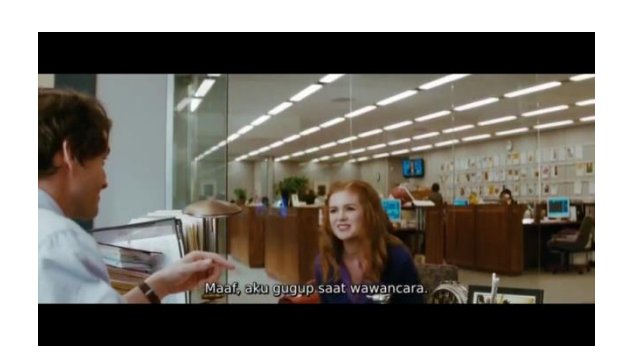
Figure 1.8 screenplay(05.03)

Rebecca : I'm sorry, I'm terrible at interviews.