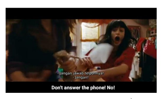
Figure 1.5 screenplay (07.01)

Suze : Ok, Bex. The most important thing is not to panic.