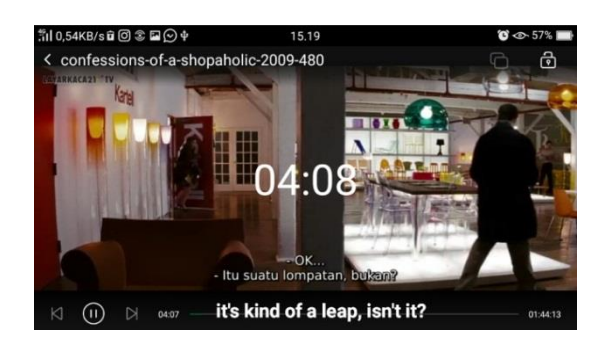
Figure 1.4 screenplay (04.08)