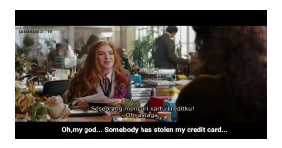
Figure 1.2 screenplay (03.12)